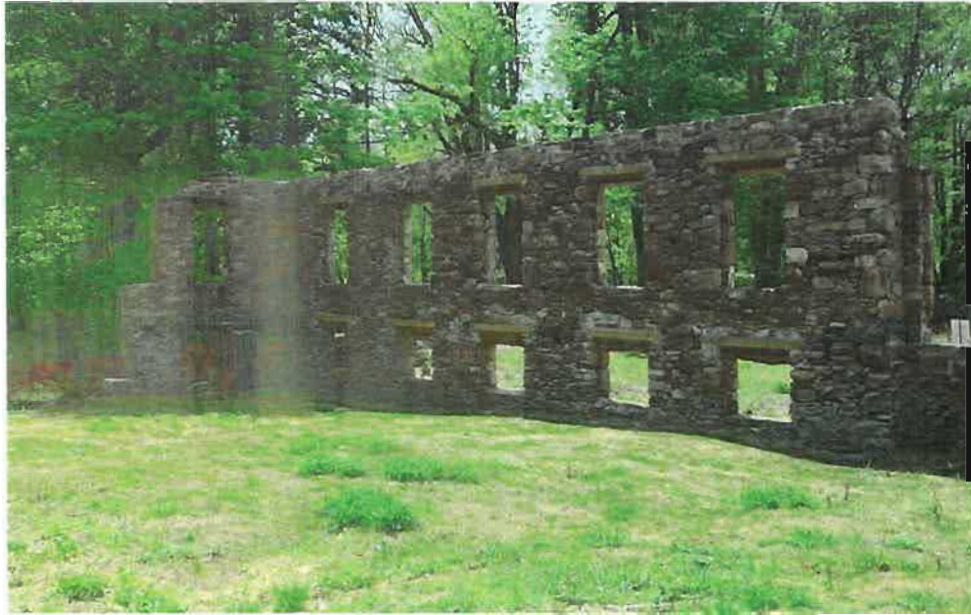
Black | Mansion | Long | wall | 2018